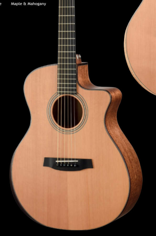
FISHMAN® Presys Blend

Pickup with Preamp, Tuner with LED-Display, 3-Band EQ, Phase-Switch, Microphone Blend, Notch-Filter against Feedback, Battery-Indicator