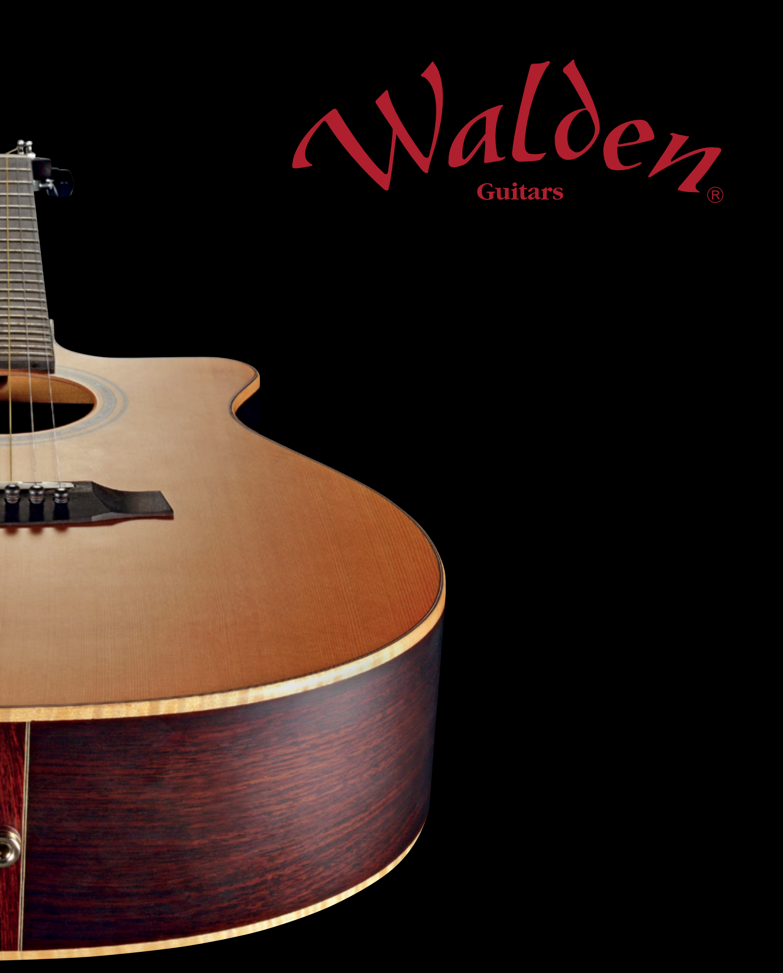
my path \cdot my dream \cdot my Walden